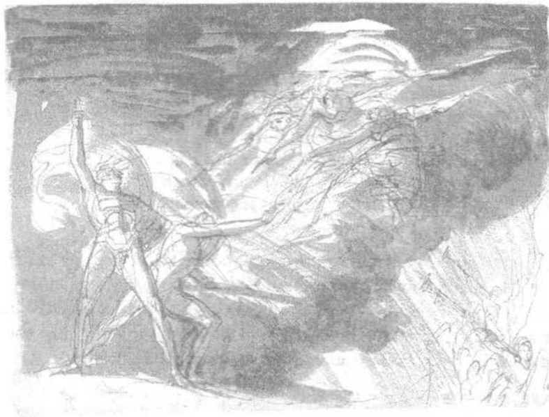
Macbeth, Banquo and the Witches (1.3; 1792)