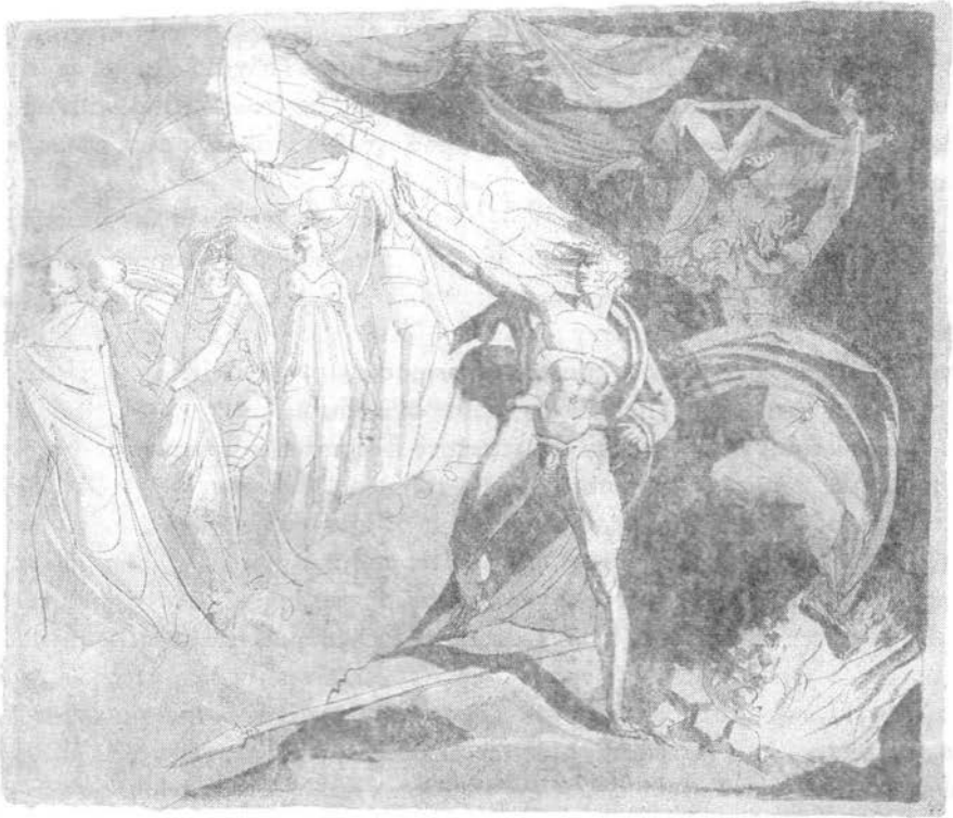
The Three Witches Show Macbeth the Descendants of Banquo (4.1; 1773)

The simplicity of the pictures is thus deceptive; these pictures are more like riddles, or – perhaps with only a slight exaggeration – objects for meditation, like emblems. Emblems normally consist of three parts: a motto, an inscriptio or subscriptio, and the image. Formally, there is an obvious parallel between the emblem and the literary illustration, which itself has three parts: a title, a literary text it is based on or related to, and the picture. But there is deeper resemblance between the emblem, which is not merely an art form, but a mode of thought, and Fuseli's Macbeth -pictures: they both represent much more to the mind than to the eye.