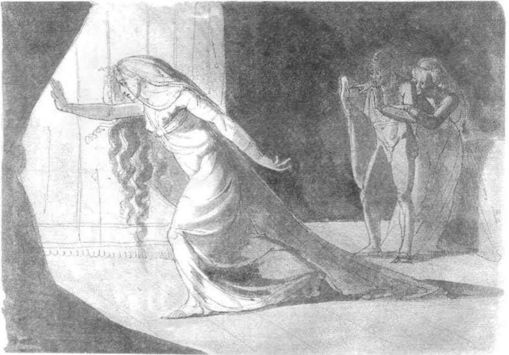
Lady Macbeth Sleepwalking (5.1; 1772)

Now we can answer our initial question: yes, it is the "transvestite thing" wherein Fuseli catches the conscience of the King and the Queen. But in a negative way. By showing behind the many different faces of the King and the Queen the Macbeths' murky hell of never-ending internal drama, he illustrates that no external veil, not even a royal costume, can hide or protect a person's real self once it has let in the Devil.