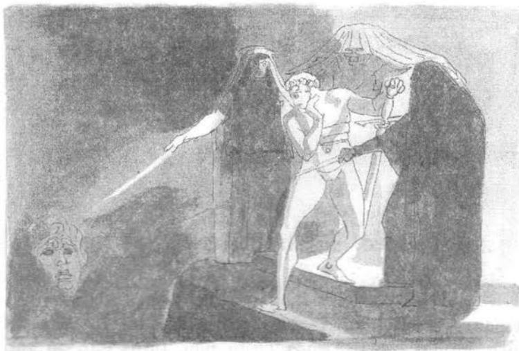
The Armed Head Appears for Macbeth (4.1; 1774)