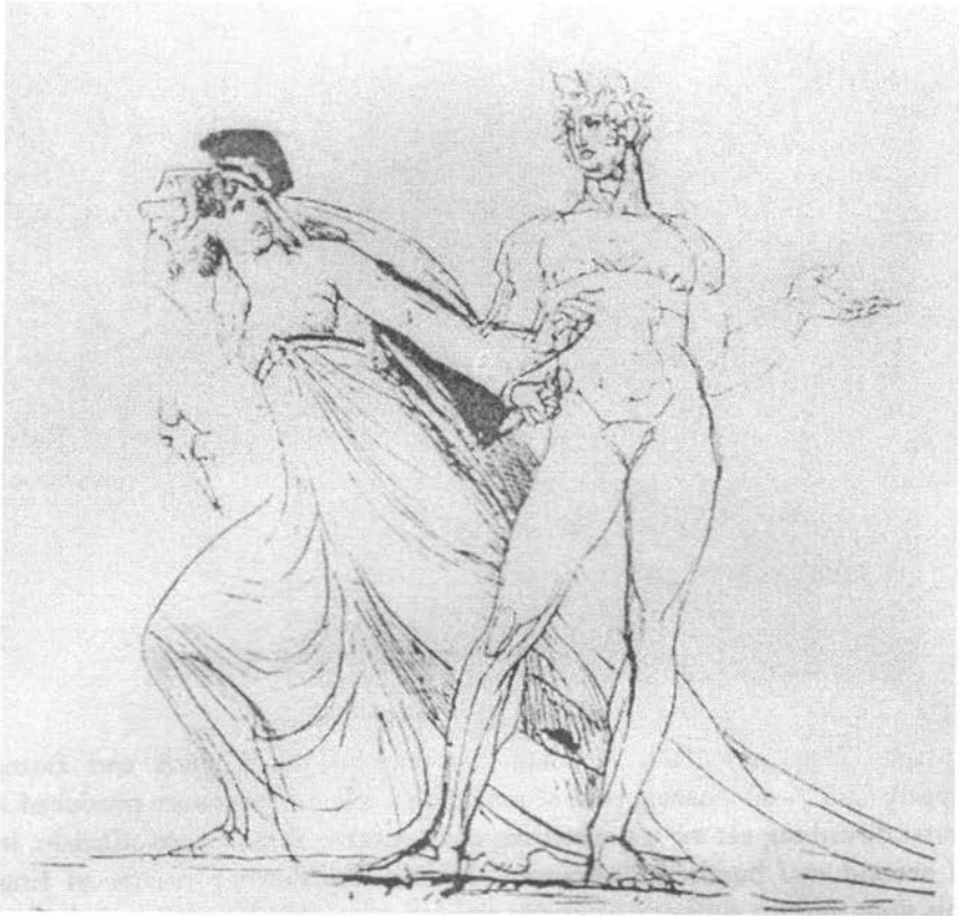
Macbeth and Lady ("Give me the daggers ...," 2.2; 1795-1800)