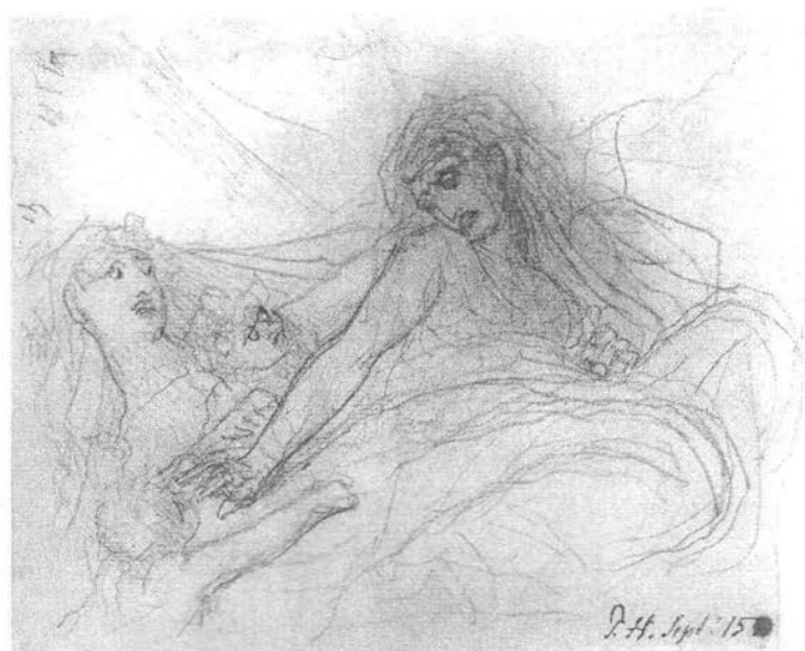
Lady Macbeth (1.7; 1815)

Between the 1770s and 1820s – about the time of the English and European “Shakespeare Cult” – an amazing man of remarkably diminutive stature produced some of the most disturbing yet most penetrating and sensitive Shakespeare-criticism, in the form of around two hundred illustrations. He was the drawing master of England during his time, and his subject matter was dramatic, macabre, sensual and ghostly. He left nature alone, and modelled his human bodies on Michelangelo and used them to horrify and entertain the polite society of his time. He was born Johann Heinrich Füssli, in Zurich, Switzerland, in 1741. (Later in London he anglicised his name as ‘Fuseli’ to make it easier for the English to pronounce it.) “I was born in February or March – it was a cursed cold month, as you may guess from my diminutive stature and crabbed disposition,” he wrote. 6 He came from a family of artists going back to the fifteenth century and as a boy helped his father draw and paint. While still a schoolboy he sold drawings to his friends to earn enough money to buy flame-coloured clothes. He was always a fancy dresser, with a heightened sensitivity and a not so innocent