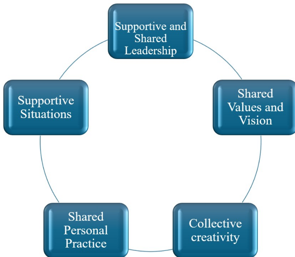
Figure 2. The Five Dimensions of a Professional Learning Community (adapted from Hord , 2004, Moet Moet Myint Lay, 2023)