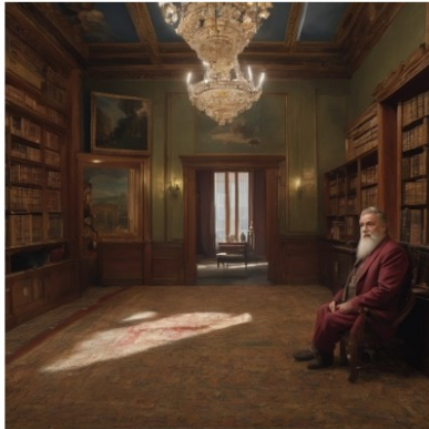
Figure 5. Al-generated images of Hungarian psychology professors using Gencraft