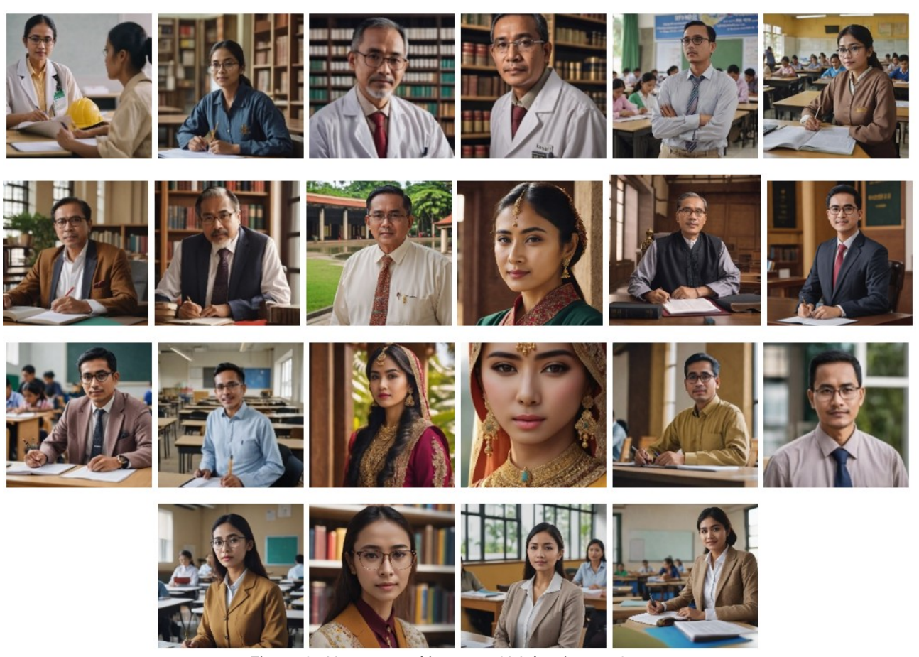
Figure 2. Al-generated images of Malaysian professors

Our examination revealed notable trends within the generated images. Hungarian images predominantly feature male professors, with a noticeable absence of female representation.