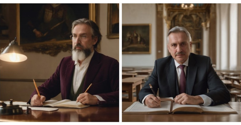
Figure 3. AI-generated images of Hungarian education professors using Generaft