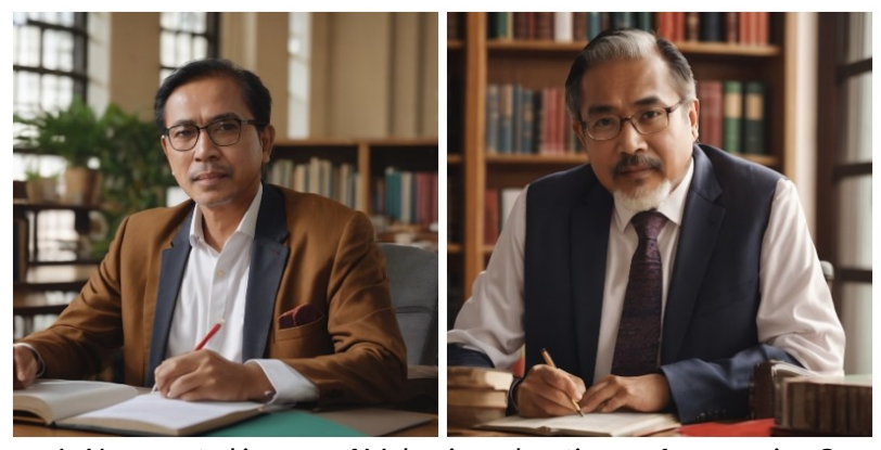
Figure 4. Al-generated images of Malaysian education professors using Gencraft

Comparing these images reveals a striking similarity: all four depict middle-aged men dressed in formal attire, consisting of white shirts and very formal jackets. This uniformity extends to their overall demeanour, as they exude a sense of formality in every aspect. Notably, three of the four individuals wear glasses, and one Hungarian professor is depicted holding two pens, an anomaly likely attributable to the program's limitations in generating accurate hand representation.