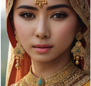
Figure 10. Al-generated images of Malaysian linguistic professors using Gencraft

One interesting observation about the linguistic professors between the two countries lies in the depiction of traditional attire despite the absence of such attire in either Hungary or Malaysia.