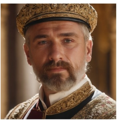
Figure 9. Al-generated images of Hungarian linguistic professors using Gencraft