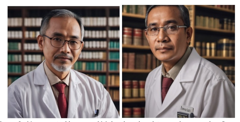
Figure 8. Al-generated images of Malaysian chemistry professors using Gencraft

One interesting observation about the chemistry professors between the two countries is the contrast in attire. In the Hungarian images, the chemistry professor is depicted wearing a brown suit with a green vest, red collar shirt, and red tie, presenting a formal and professional appearance. This attire aligns with the traditional expectations of formal dress in academic settings.