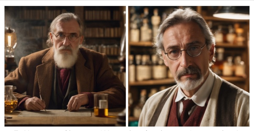
Figure 7. Al-generated images of Hungarian chemistry professors using Gencraft