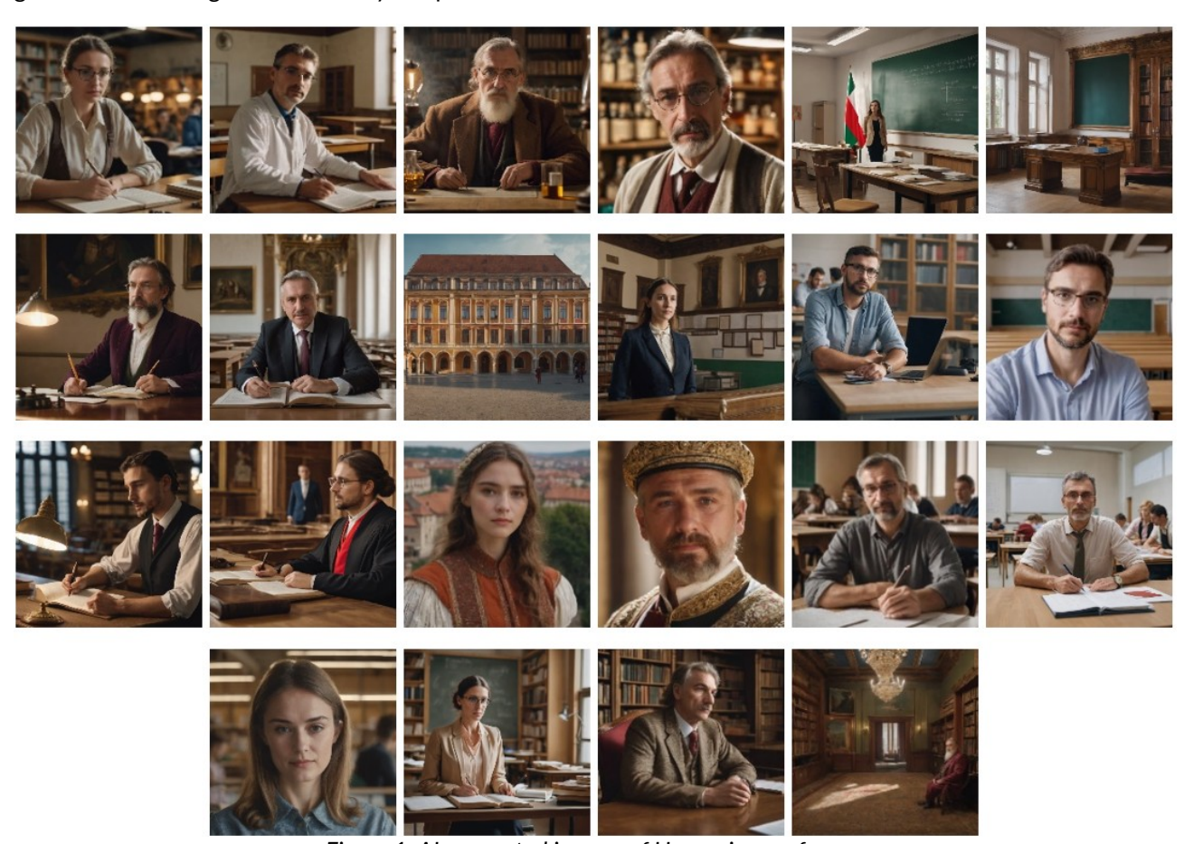
Figure 1. Al-generated images of Hungarian professors

A total of 44 images were generated, with each set comprising 22 images. Below, we present all the images generated for Hungarian and Malaysian professors.