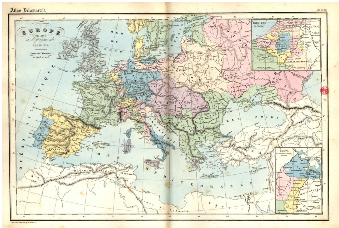
Fig. 3 Europe in 1715. In: Grosselin-Delamarche (1897), maps 66, 67, 68

From modern atlases a supplementary atlas for high school was examined, titled La France. Atlas géographique et géopolitique (Beucher et al. 2022), which specifically aims to explore spatial changes over time. It follows the guidelines of the previously mentioned atlases: its 373 pages dominantly contain textual explanation of processes. In addition, there are approximately one hundred thematic maps, mainly illustrating contemporary data, with a few series of maps showing changes of the past decade. Even though it provides a very thorough socio-spatial analysis of France, without historic or even historical maps, the development of critical thinking skills is questionable via this methodology.