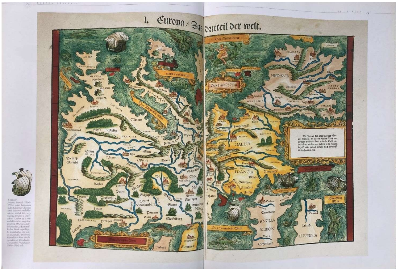
Fig. 4 Historic map page. In: Európa térképei 1521–2001, Plihal (2003)