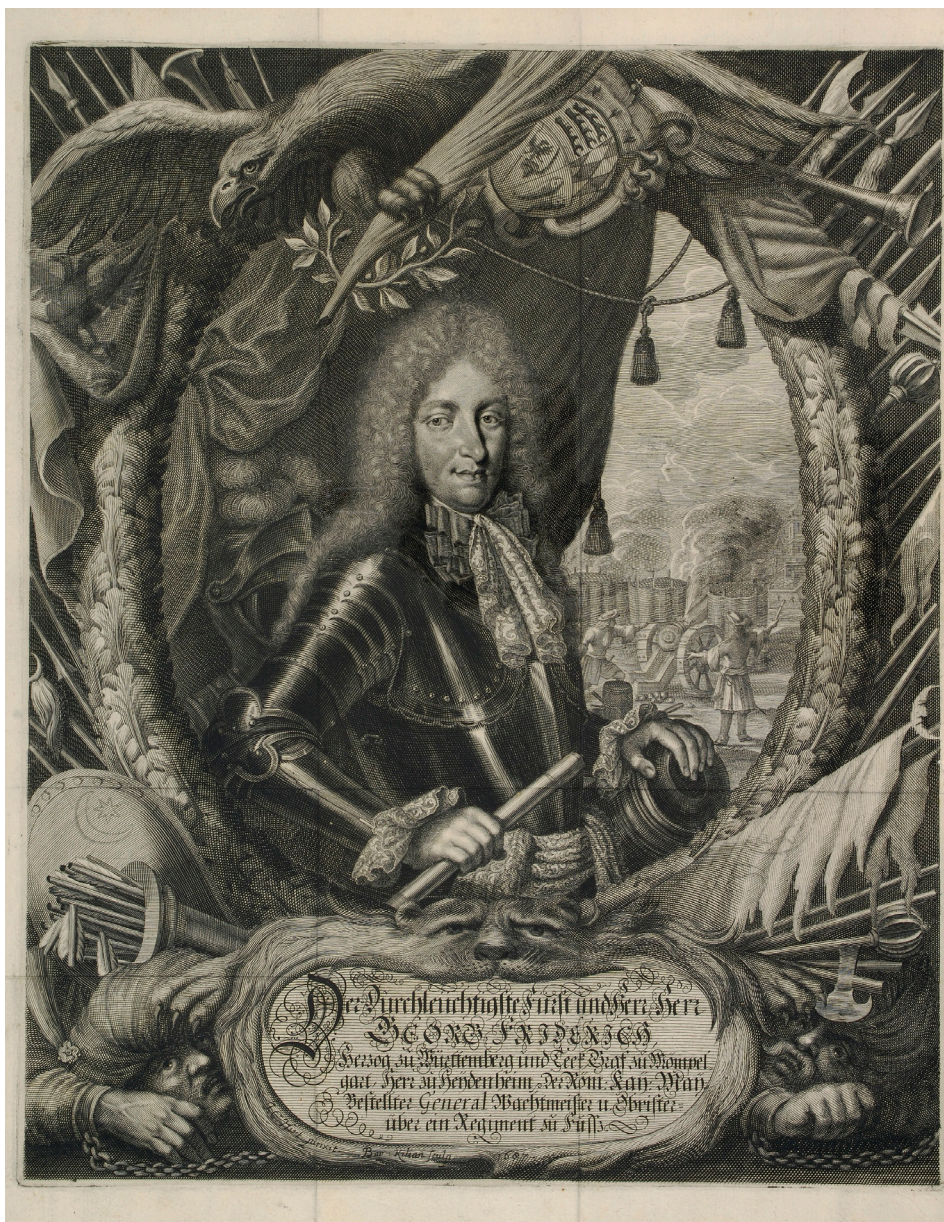
Figure 1 Portrait of Georg Friedrich Württemberg as a military hero of the Ottoman War (engraved by Bartholomäus Kilian)