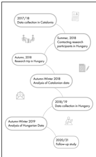
Figure 2 Time frame of the research

structures of the stories, and finally, the distribution of them between school types, grades and terms were carefully examined and analysed. (Figure 2)