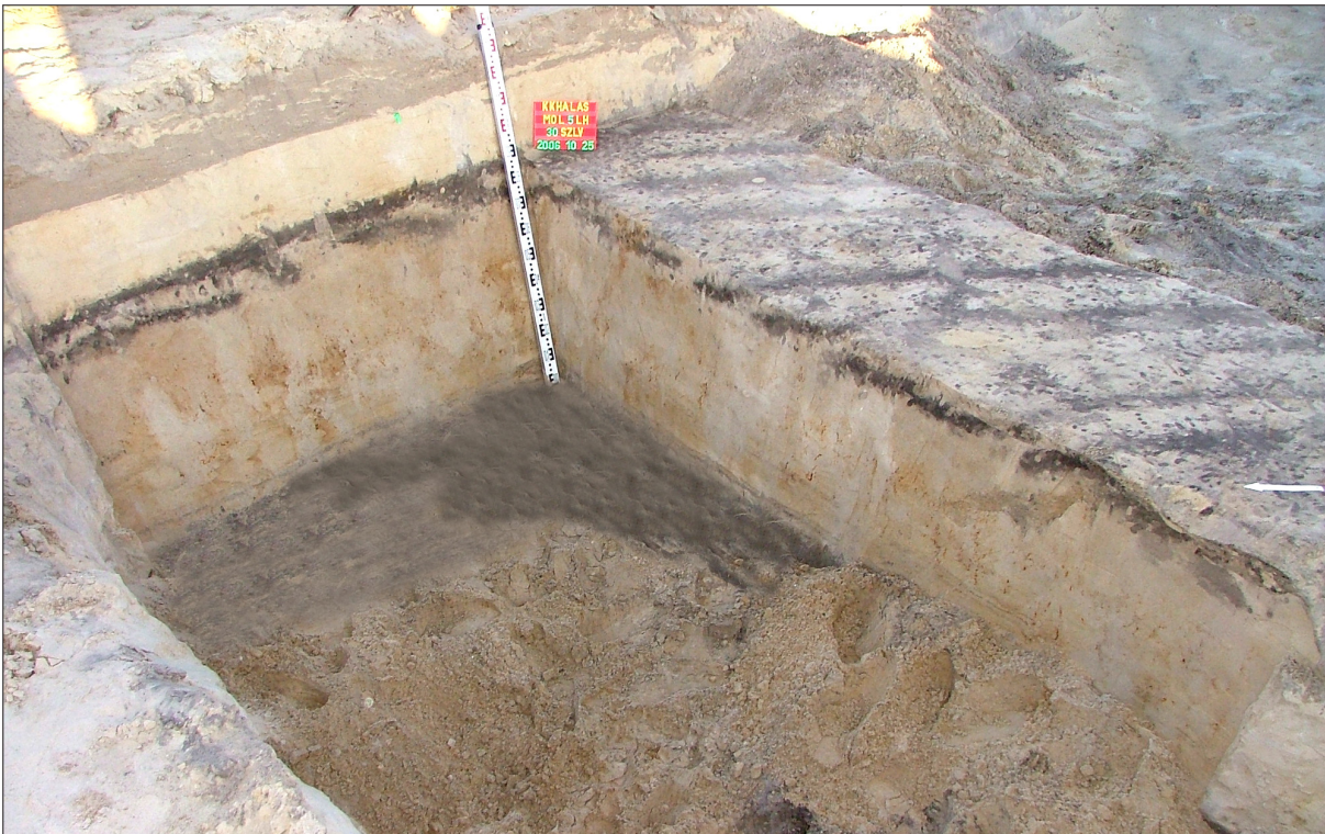
Fig. 5. Plough-land from the 13th century covered by sand, near Kiskunhalas.

parallel to this the municipal system had undergone an integration after the Mongol invasion and destruction, and significantly less settlements were developed both in the number and in scope. These would not justify the appearance of quicksand after the 13th century in Kiskunság. In the given the climatic conditions during this period only human involvement could be accounted for the movement of sand. This refers to differences between the land usage during the Árpád age and the late Middle Ages, which ultimately result in differences in the various economical and management systems. Considering the Cumanians' way of life, who were moving into the area, we can have a satisfactory explanation for these anthropogenic effects, and it can be believed that the roots of the large livestock management and the use of the plains date back to the 15th century, which have been also mentioned in historical sources (Fig. 5).