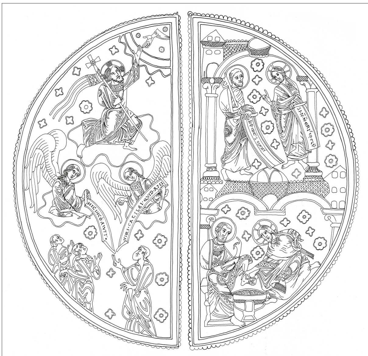
Fig. 2. Reliquary of St. Peter, enamelled bronze plates.

Even if the historical sources are silent about the important life events of Pétermonostora during the 13th century, the results from the direct archaeological evidence demonstrate that the life of the village has experienced serious fracture in the mid-13th century. The collapse of Pétermonostora in the middle of the 13th century was linked to a sudden incident, for which the Mongol invasion of 1241–1242 was an obvious explanation. Pétermonostora's importance can also be accounted for by the fact that it allows us to draw general conclusions that reach beyond its limits as well as its role as a vital quarry. Since this settlement was not spared in the area of municipal order and of impact of such processes that symbolize the whole history of ridge.