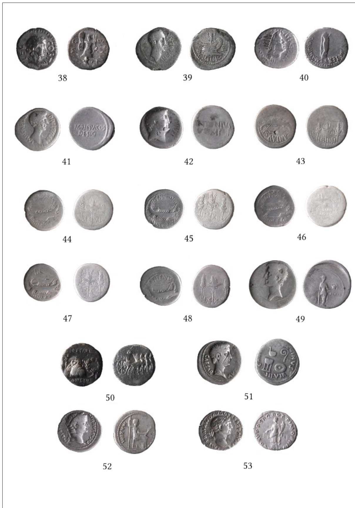
Fig. 6. The coin hoard of abasár (Cat. Nr. 38–53).