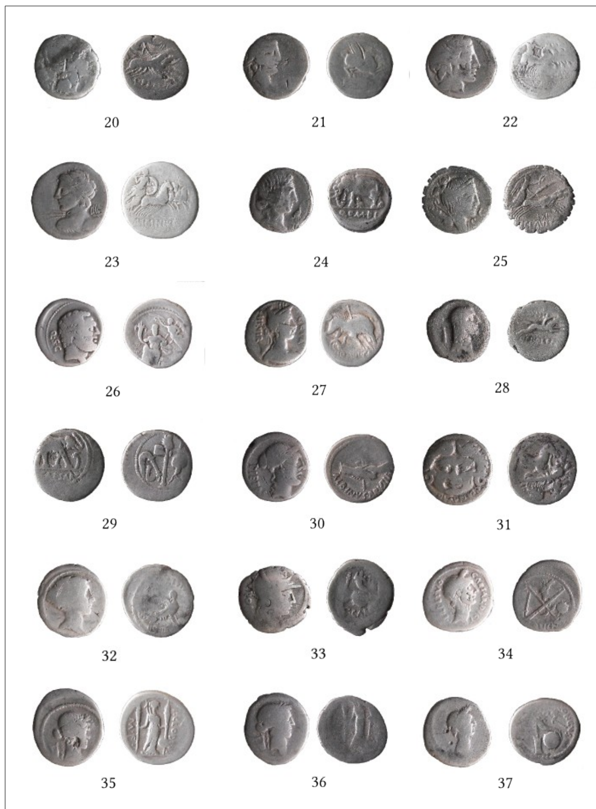
Fig. 5. The coin hoard of Abasár (Cat. Nr. 20–37).