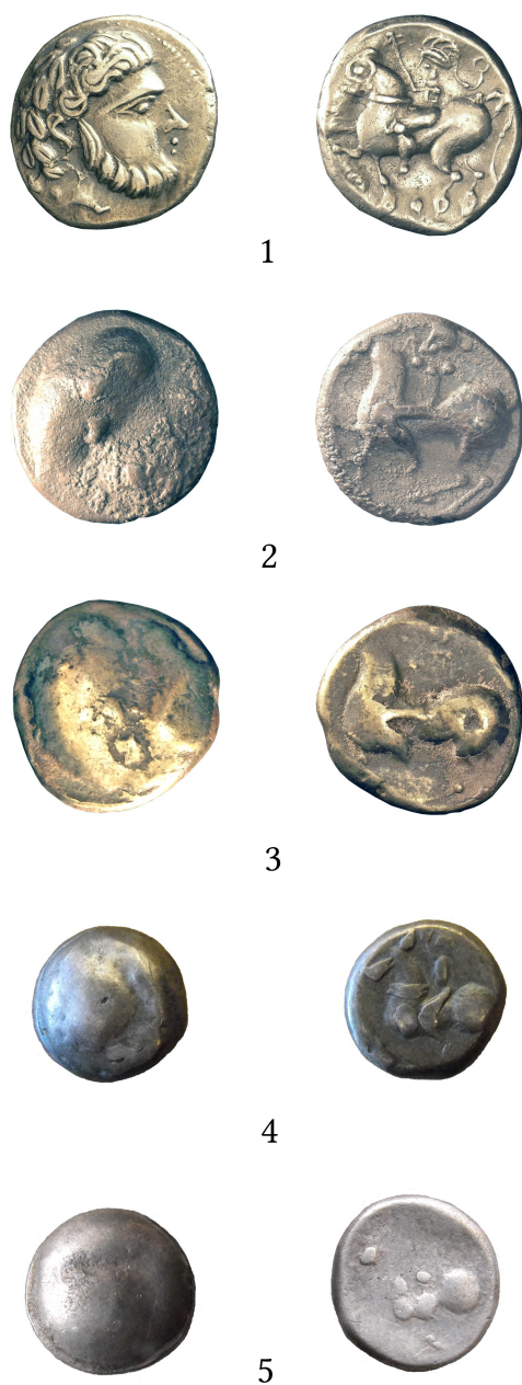
Fig. 2. 1. Baumreiter type (MNM 1.1954.3). 2. Early Lapujtő type with rider (MNM R.I. 6274). 3. Early Lapujtő type with traces of rider (MNM 49.1909.2). 4. Later Lapujtő type with horseman (MNM Dess. 802). 5. Later Lapujtő type (Cat. Nr. 3).