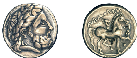
Fig. 3. Audoleon type (MNM N.I. 5356).

The fragment of Imitation of Philip II of Macedon – though the type cannot be specified – according to its weight and depiction seems to be struck in an earlier phase of Celtic coinage; it was probably struck in the first half of the 2nd century BC, or even earlier.