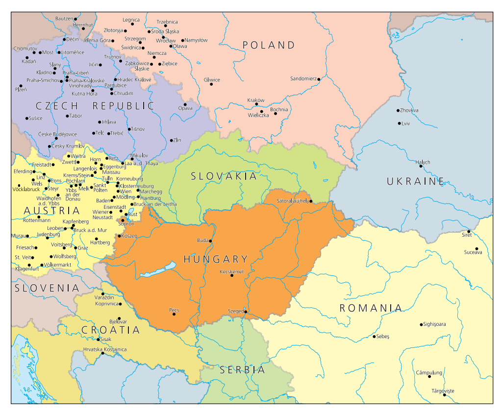
Figure 1 Historic Towns Atlases published in East Central Europe up to August 2021. Cartography: Béla Nagy.

After 2000, further East Central European countries, namely Romania (2000), Croatia (2005), Hungary (2010) and Ukraine (2014), joined in. Plans are in place to launch the atlas series in Slovakia and Slovenia as well, both of which would fill long-standing research gaps (Fig. 1).<sup>13</sup> In this region, the issue of changing political borders is even more complex than elsewhere in Europe. The adherence to the current borders is an acceptable compromise; however, due to the specificities of the source material and the pertaining historical research, more cross-border cooperation in the editorial work on the atlases would be desirable and justified. All East Central European atlas series—unlike those in Western Europe—publish the topographic study and the captions to all illustrations in bilingual form, adding German or English translation to the local vernaculars.