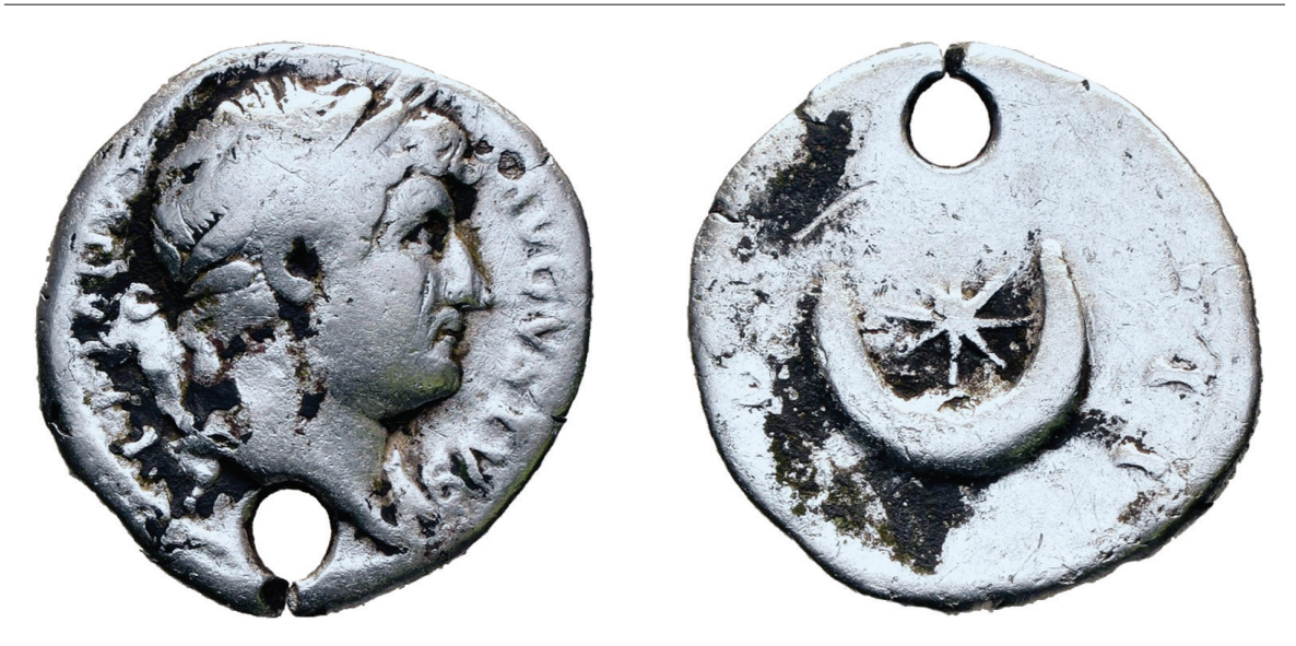
Fig. 2. A pierced coin of Hadrian with star and crescent from the Coin Collection of the Eötvös Loránd University.