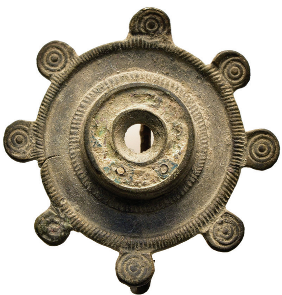
Fig. 4. An enamelled disc fibula with tutulus from a private collection.

Inspiration for the elaborate frame could have been taken from the Roman enamelled disc brooches (Scheibenfibel) with protruding circular decoration on the sides, which were popular in the Barbaricum from the 2<sup>nd</sup> c. to the 260s/270s.<sup>21</sup> These have the same concentric circles on their small projecting round disks as the Martfű medallion (Fig. 4). The flat disc fibulae with segmented rims<sup>22</sup> show a concentration in the Middle Tisza region similarly to the crescent and star reverse Sarmatian coin imitations.23 The other types with similar decoration are the discoidal brooches also very popular in the Barbaricum from the late 2<sup>nd</sup> to the 5<sup>th</sup> c.<sup>24</sup> These more ornate fibulae correspond to the elaborate mounting of the coin imitation. In fact, disc fibulae with glass intaglios in the form of human heads are