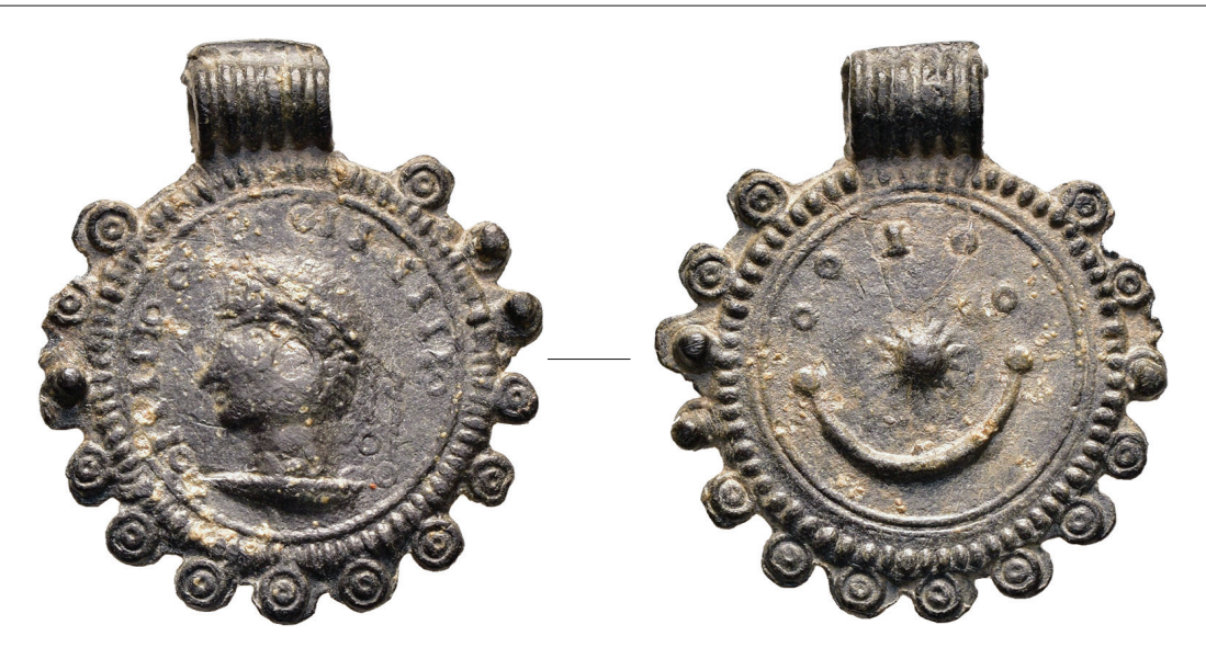
Fig. 1. Sarmatian cast medallion from Martfű-Csesz-dűlő.