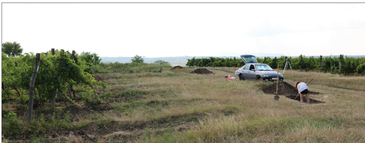
Fig. 2. The excavation area at the site with Trenches S1–S3.

The excavation lasted for two weeks between 30 th July and 10 th August 2018. The main aim was to obtain stratigraphic information about the position of the industries, as well as to characterize the quaternary sediments covering the hilltop. A 5 m wide empty zone running parallel between the dirt road and the edge of the vineyard provided a chance to find an undisturbed situation. Along this zone, three trenches (S1, S2, S3 from west to east) were opened, 2×1 m each and situated at a distance of 15 m from each other (Fig. 2). All of them were excavated to the bottom of the sequence, represented by the weathered layer of the rhyolite tuff of Miocene age reached a depth of about 150 cm. In Trenches S2 and S3 (Fig. 3), the stratigraphy was the same, while the layers were less clearly visible in Trench S1. At the top of the stratigraphy, a 25–35 cm thick ploughing layer was observed suggesting that this zone was never planted by the vineyard. Under this agricultural layer, the sediments seemed to be undisturbed. From top to bottom clayey sediments of different colours succeeded: grey (5–10 cm thick), dark grey (20–25 cm), brownish grey (25–30 cm), and brown (35–50 cm). In the lowermost layer periglacial polygons were recognized.