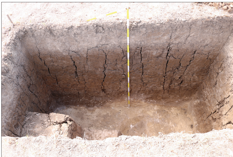
Fig. 3. The stratigraphic sequence of Trench S3.