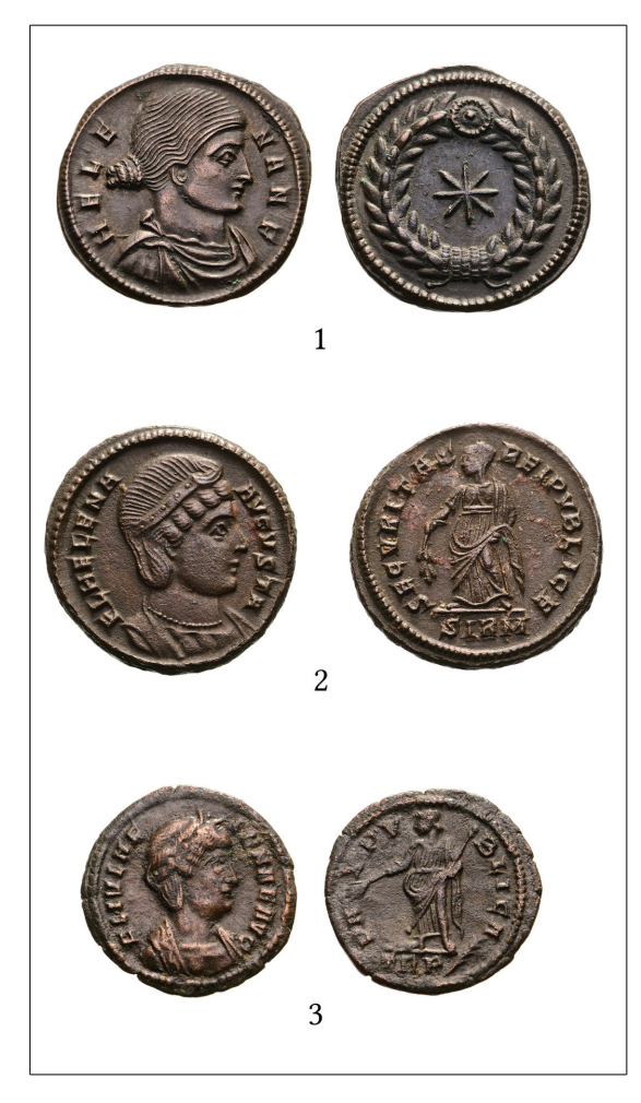
Fig. 5. 1. Helena AE3. 2. Helena AE3. 3. Helena AE4.

Therefore it is possible, that the coins were minted for Flavia Julia Helena, and the names Flavia Maxima Fausta or Flavia Maximiana/Maxima Theodora had influenced the name-form. Theoretically the inverse situation is also possible, that the coins were minted for Fausta or Theodora. On the other hand several arguments can be drawn up against identifying Helena on the coin with the mother of Constantine: the FLAV abbreviation is never used on her coins, apart from two rare Thessalonican issues dated to 318-320. She always wears a necklace. In the early issues her hairstyle is different, her title is not Augusta but Nobilissima Femina, and only her Helena name is represented (Fig. 5.1). In the issues dated 324-329 the title Augusta is never abbreviated, the name is always represented as FL HE-LENA (Fig. 5.2). The last coins minted for her were issued between 337 and 340 together with the coins of Theodora. Though these are posthumous coins, they are not commemorative ones in the classical sense but had an actual political message after the massacre of most of the male descendants of Constantius I.14 The name is always in dative: FL IVL HELENAE AVG (Fig. 5.3).