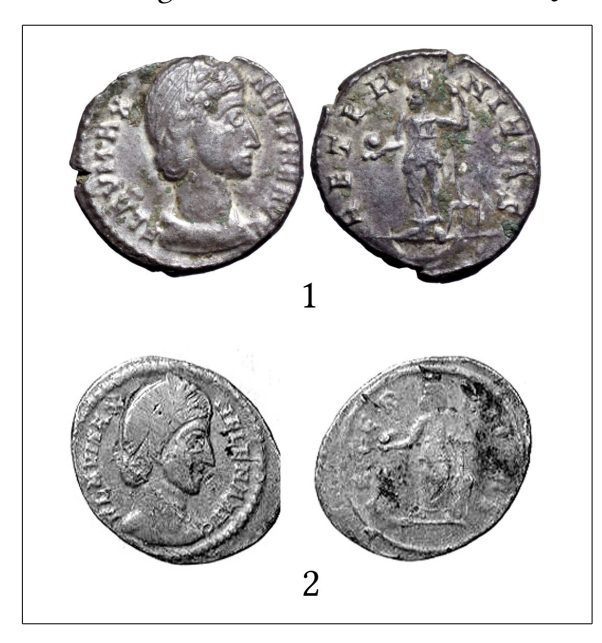
Fig. 3. 1. Flavia Maxima Helena, siliqua, London. 2. Flavia Maxima Helena, siliqua, Madrid.

when – except for the time of the tetrarchy – there was no good quality silver coinage. The style of the silver coin, not yet cleaned at the time, did not fit into the period, but in the case of an imitation it did not seem to be a real problem. So I identified the empress as Helena, mother of Constantine I, though only gold and bronze coins of her are known, and assumed, that the name was given in error instead of Flavia Julia Helena.