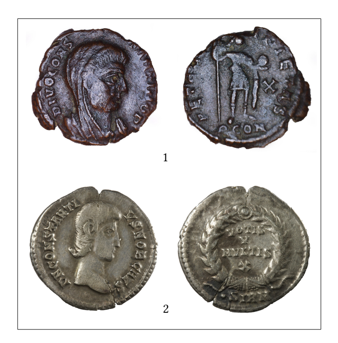
Fig. 8. 1. Divus Constantine I, AE4. 2. Constantius Gallus, siliqua.

the bun and the braid bound up at the back seem to be added posterior to a (probably originally not draped) male bust.<sup>22</sup> Thus, the coins were likely struck in the late 350s or early 360s. It is quite improbable that coins were minted for Helena Maior at this time, as real commemorative coins were never made for her, or if such had been struck there is still no reason for the haste and the slobbered work.