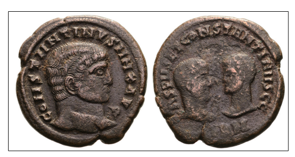
Fig. 6. Constantine I, medallion.

The silver coins of Helena do not match the style of any of the three periods, moreover compared to those they can be judged being of crude style, they seem to be quite slobbered, as the dies were made in haste. The coins are also special because they bear no mint-mark, which may imply that they were not meant to be a regular currency, but were made for some special occasion. Though metallographical analysis was made on only one coin, its 80% silver content differs from the 90% standard of the silver coins in the middle third of the 4th century. <sup>15</sup>