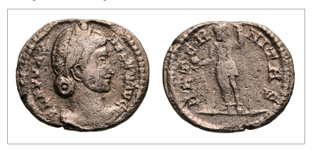
Fig. 1. Flavia Maxima Helena, siliqua, Budapest.

The weight of the coin is 2.27 g, the die axis is 12 h.