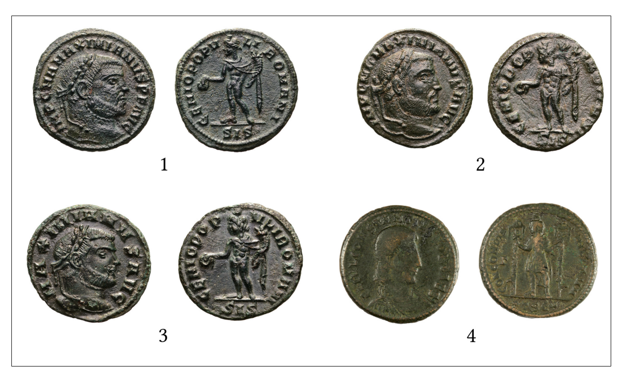
Fig. 4. 1-3. Galerius, laureate fractions. 4. Constantius Gallus, AE2.

dealer in 2002, so chronologically this is the first known coin. The weight, the diameter, and the die axis are not known, even Mr. Vico could not provide more information. Based on the photographs I assume the axis to be 12h. Allegedly a metallographical analysis had been made on the coin, showing it to be 80.75% silver, 17.91% copper and 1.34% other". <sup>11</sup> Jesús Vico assigned the coin to the mother Constantine I' and dated it around 310, to the end of the tetrarchic silver (billon) coinage. This can be ruled out as the depicted hairstyle appears only in the mid–320s on the coins of Helena and she received the title Augusta in 325.