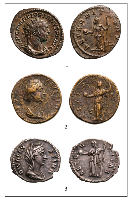
Fig. 7. 1. Florian, antoninian. 2. Faustina Maior, sestertius. 3. Faustina Maior, denarius.

or small medallions and not regular currency. I have collected the weight of 32 coins from catalogues and sales, <sup>17</sup> the great variation of weight is obvious. I do not know of a metallographical analysis made on these coins, but most of them seem to be made of silver, while a few one look like bronze coins. It is very likely that the Helena silver coins were meant to be siliquae, but as they were not regular currency, it is not possible to date them on the basis of weight and silver content.