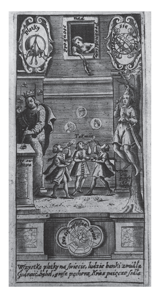
Figure 8 [Mirowski,] Młotek duchowny w sercach ludzki drelujący... , Gdańsk: David Friedrich Rhete, 1656, BSW, O.128.44 , f. F,v-F,r

Principis clementia (The mercy of the prince), according to which "[because] the king of wasps will never sting [...] these will declare merciful governance, moderate kingship, and sacred laws entrusted to good judges".75 This is a paraphrase of Seneca's concept (Cl. 19,1) after Pliny (11,17) of the bee king as a benevolent ruler who is respected despite not having a sting. According to Horapollo (1,62) bees symbolize a king's obedient subjects-which could be represented by the swarm flying around the figure's head in Mirowski's emblem. In the engraving, the ruler kills the bee (his royal subject). The warning which accompanies the image explains that one should not give too much significance to earthly rulers as both their graces and their power will pass: "This play also / Thus passes" ("I ta zabawa / Tak mija"). This likely refers to Kempis's devaluation of earthly rulers and assertion that Christ is the real king as well as the hic transit gloria mundi motive that supposedly originates in the Imitatio Christi.76 The message is complemented by a figure to the right of the main image, hanging on a tree branch by his