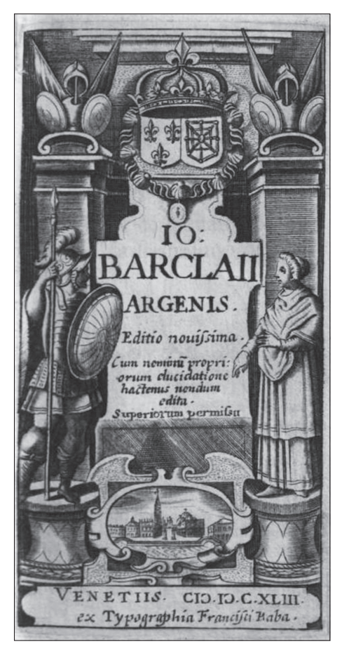
Figure 5 Barclaius, Argenis. Editio novissima cum nominum propri orum elucidationne hactenus, Venetia: Francisco Baba, 1643, ON 224.465-A (frontispiece)

The same compositional scheme recurs in each of the four emblems in most copies of the Młotek ducho-wny . <sup>61</sup> Each of the emblems' icons is divided into seven panels: the central strip constitutes the main scene and contains a narrative part, with two figures on either side to supple-