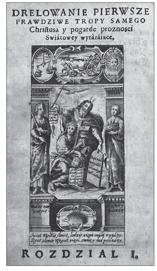
Figure 7 [Mirowski,] Młotek duchowny..., Gdańsk: David Friedrich Rhete, 1656, NZiO, XVII-4488-II, f. A<sub>s</sub>r

mirror image, which means that the engraver redrew the original engraving on a copperplate (thus the reversal). Thus, the engraver of the Gdańsk emblems probably used ready patterns, disassembling their compositions and adding new elements. In Mirowski's collection, the central figure of this icon is Moses holding a stone tablet with the inscription: "God above all, thy neighbor as yourself" ("Boga nad wszystko, bliźniego jak siebie") in his left hand, and an unfolded scroll with the inscription "Shun evil, do good" ("Stroń od złego, czyń dobrze") in his right. A dove is flying above Moses' head (the Holy Spirit), and a woman with a wreath on her head (Ecclesia) is sitting at his feet and embracing a cross, while holding a laurel branch in her left hand and a key and tiara in her right (the symbols of papal supremacy and power). Propped up on Ecclesia's knees, there is a book with the inscription: "[Come] to me,/ babes, / [come] to me, / I will teach you / the fear of God" ("Do mnie,/ dziateczky,/ do mnie,/ bojaźni was/ Pańskiey nauczę") (Fig. 7). The scene is