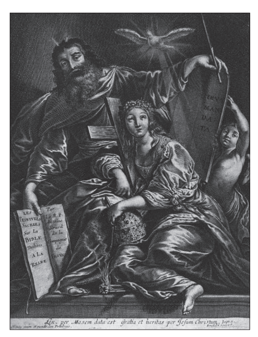
Figure 6 Girard, Les peintures sacrées sur la Bible dédiées à la Reyne, Paris: Antoine Sommaville, 1656, BMdL SJ E781/13 (frontispiece)

ment the narrative, which aligns popular architectural compositions present in frontispieces in the seventeenth century.62 In this case, the upper strip comprises three small panels and discusses the main theme symbolically; while the lower strip is just one panel and it is the most challenging to relate to the engraving's main message sometimes, it is linked directly to the lemma.63 These findings have been made more challenging by two existing copies held at BSW (O.128.44) and BPG (XXo B.o. 1871), where I discovered two engravings which had never been listed in bibliographies and catalogs (Figs 8-9). The two newly identified engravings are placed before the engraving the Drelowanie wtóre ("Hammering Two") (BSW, BPG, cf. Fig. 8) and the engraving Drelowanie trzecie ("Hammering Three") (BSW, cf. Fig. 9).64