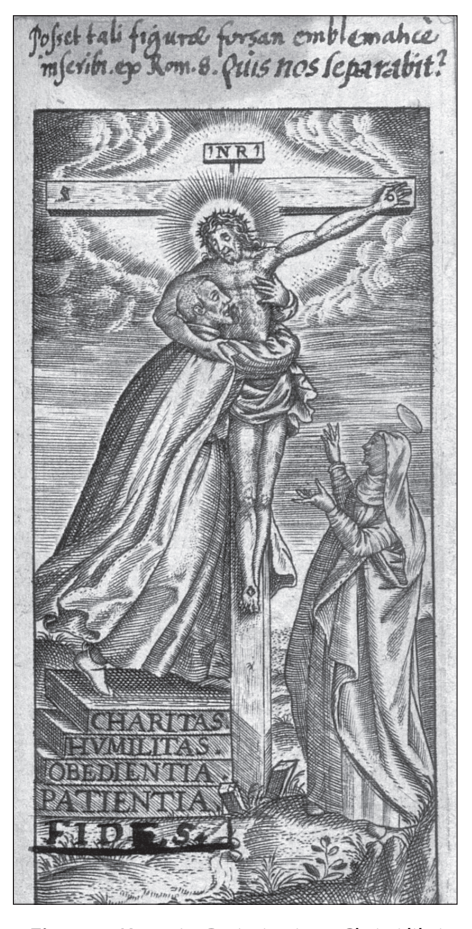
Figure 1 Kempis, De imitatione Christi libri quatuor , Douai 1608, NkČr BG X 38, f. 158 r

In the case of Polish translations, almost all of them were made by Jesuits (or their alumni) except the one that is the subject of this article— Młotek duchowny ( Spiritual Hammer ) printed in 1656. Neither the author of the oeuvre nor its translator were mentioned on the titlepage or in the colophon. It consists of prefatory matter, four chapters, and a template of the last will "translated from Italian." <sup>14</sup> The composition repeats the "Catholic" arrangement of the content. In addition to the illustrated title page, each chapter is accompanied by a large engraving, and there are also small decorative graphical elements. <sup>15</sup>