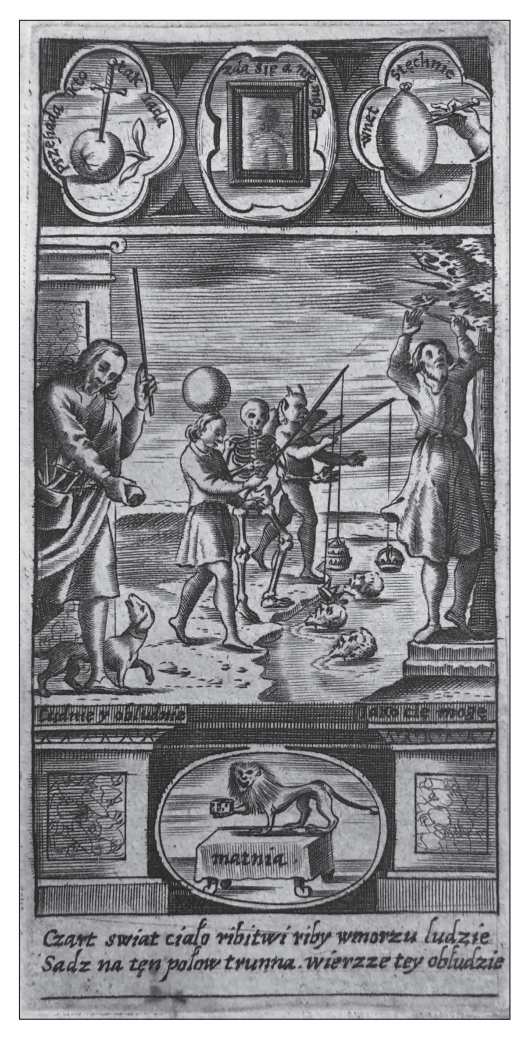
Figure 9 [Mirowski,] Młotek duchowny w sercach ludzki drelujący... , Gdańsk: David Friedrich Rhete, 1656, BSW, O.128.44, f. between H<sub>1</sub>v-H<sub>2</sub>r

since the text corresponds to the image composition. This makes one reconsider whether it is justified to speak of an emblematic series, because, as can be seen from this example, one cannot be sure that the publisher did not paste in additional engravings It might be the case that they have not survived to our times because someone tore them out, e.g., for devotional reasons (people often used to cut out engravings and paste them in their notebooks)81 or collector's reasons (this was a particularly popular trend in the nineteenth century).82 It is also possible that only some of the copies received additional engravings. The upper strip of the emblems refers to the scenes below it. The first cartouche shows making lace or rope using bobbins, with the inscription saying: "Gossip" ("Plotki"). Braiding, which was thought of as a women's pastime, apparently to Mirowski seemed the perfect situation for spreading rumors. While this relates to Kempis's warning that it is better to say nothing than to gossip, it also corresponds to Wisdom 11:17 and the figures below: the rumormonger can suffer from rumors much like the bee can be killed